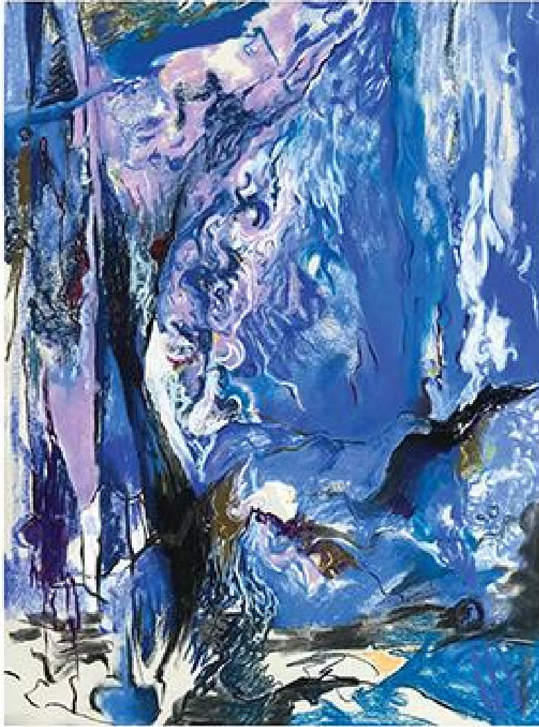
Climate Change 2018