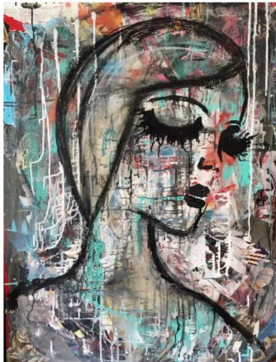
Be Still, 2018

LONG HALL GALLERY @ Toast Coffeehouse 46 East Main Street, Patchogue, NY